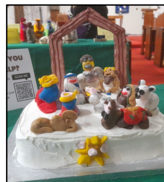
3rd placed Group 4th Wendover Brownies