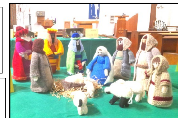
(Right) 2nd Individual Win Woods