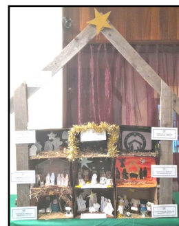
Group winner John Hampden School

The winning cribs are pictured below. Congratulations to all entries for helping to create a wonderful display.