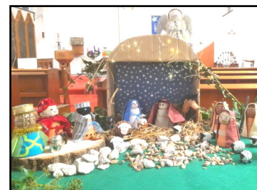
(Left) 2nd placed Group Evening W. I.